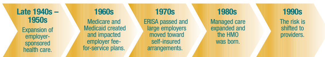
Fig. 1: Evolution of the U.S. Health Care System

Every decade seems to have produced a transformation in how health care is administered in the United States.